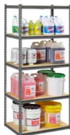
Medium Profile Capacity: Up to 1,000 lbs. per shelf, evenly distributed