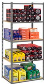
Low Profile Capacity: Up to 800 lbs. per shelf, evenly distributed