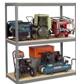
Extra Heavy Duty Capacity: Up to 2,500 lbs. per shelf, evenly distributed