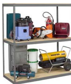
Heavy Duty Capacity: Up to 2,250 lbs. per shelf, evenly distributed